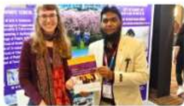
Representative University Of Albany USA

Global Reach With partnerships in 25+ countries and 1700+ institutions, we provide unmatched access to world-class education and career opportunities.