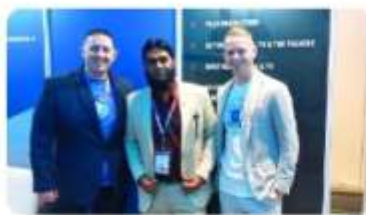
Representative University of YourkVille Canada