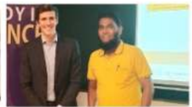
School Representative France