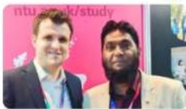
Representative University Of Nottingham UK