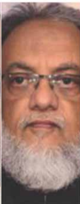
MIRZA YAWAR BAIG